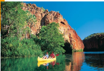
EXPLORE THE BEAUTIFUL LAWN HILL NATIONAL PARK