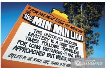
THE BOULIA MIN MIN LIGHT ENCOUNTER SHOULD NOT BE MISSED

Beginning in MT ISA on 19th August, the 2009 JUST4KIDS MOTOR TRAIL visits Lawn Hill National Park, Cloncurry, Boulia, Birdsville, Innamincka, Thargomindah, Quilpie and Cunnamulla before finishing in ST GEORGE on 28th August.