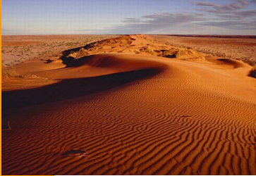
BE PREPARED TO CONQUER 'BIG RED' AT BIRDSVILLE

Celebrating Q150—Queensland's 150th Birthday